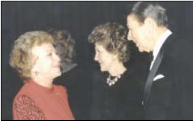
President Ronald Reagan was the honored speaker at CWA's Fourth Annual Convention in 1990. "In just a few short years, you have become the largest politically active women's organization in the nation," he told the crowd.

is drawn—Jesus told us that we are either for Him, or against Him. Today we have many highly educated, talented individuals in our universities, the entertainment world, the media, and the courts, which push false visions. But like Plato in ancient Greece, they depend only on their own logic and the creativity of their imagination, which are not based on Truth.