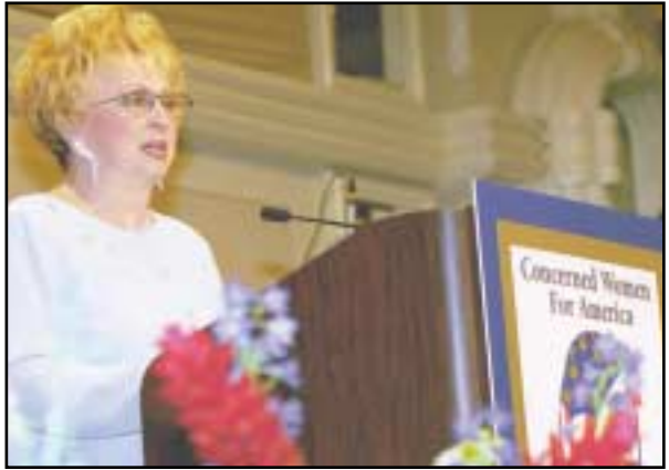
At CWA's 17th National Convention last September, Mrs. LaHaye concluded the event with a rousing call to action.